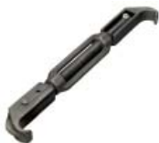
OTR extension for spit-ring rims C4007611