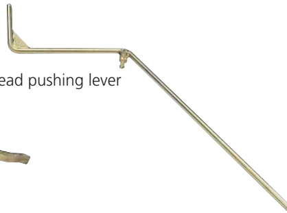
Bead pushing lever