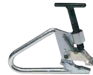
Clamp for steel rims