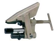
Clamp for alloy rims C4021852