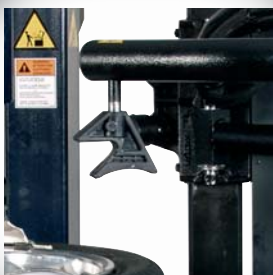
Gentle demounting with the bead pusher