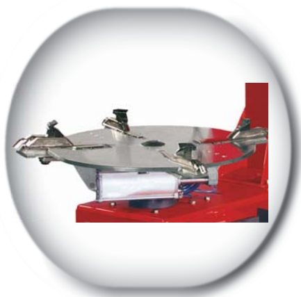
Self-centring turntable with two clamping cylinders (plastic protectors are optional extras).