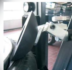
The plastic bead breaker disc is a useful accessory to prevent any damage to the rim