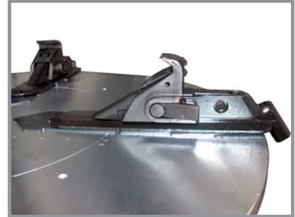
Max. outer clamping capability is 24".