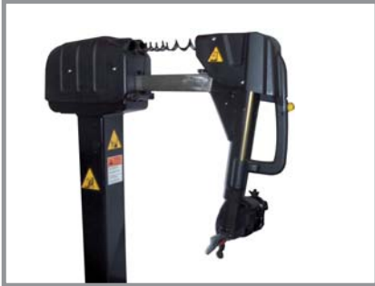
The post has been reinforced to cope with the high forces created in the mounting and demounting procedures.