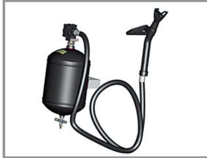
GT version Supplied with an external top-side bead seating and inflating device.