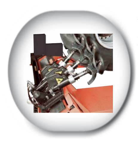
Precise The tool support can be adjusted in three angular locations.