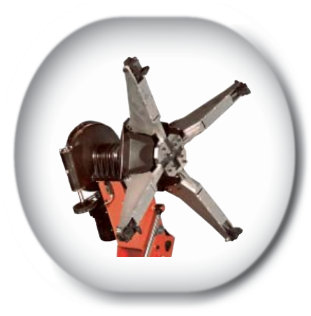
Versatile To clamp rims of 4" – 58" without any accessories.

Flexible The mounting tool is adjustable by 180 deg. irrespective of arm position.