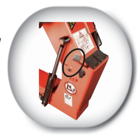
Powerful The special design with adjustable studs ensures long life of the chuck arm hinge.